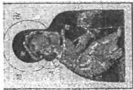
Theotokos of Vladimir