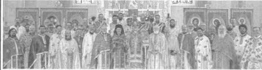
PLC June 2019

October 22-24: Fall Gathering YAM, SOYO & Antiochian Women