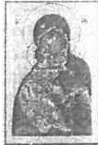
85Theotokos of Vladimir