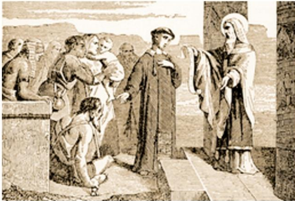
Saint John the Almsgiver