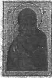
Theotokos of Vladimir