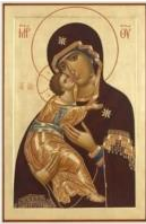
Theotokos of Vladimir