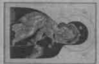
Theotokos of Vladimir

EASTERN ORTHODOX WOMEN'S GUILD OF GREATER CLEVELAND Unity Through Participation