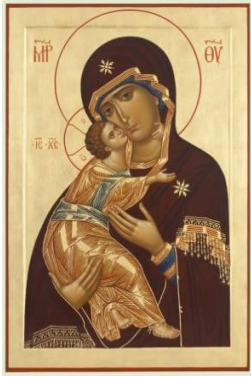
Theotokos of Vladimir