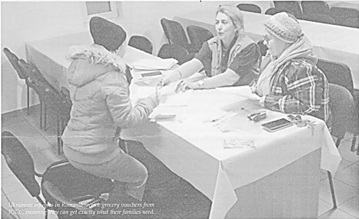
Ukrainian refugees in Romania receive grocery vouchers from IOCC, ensuring they can get exactly what their families need.

IOCC has a long history of humanitarian and development programming in Eastern Europe, beginning in the early 1990s following the collapse of the Soviet Union. With strong partner relations across the region, particularly within the network of the Orthodox Church, and a portfolio of humanitarian response in Romania, Ukraine, and the western Balkans, IOCC was positioned to respond quickly, starting in March 2022. Programs are now addressing immediate and long-term needs in both Ukraine and neighboring countries.