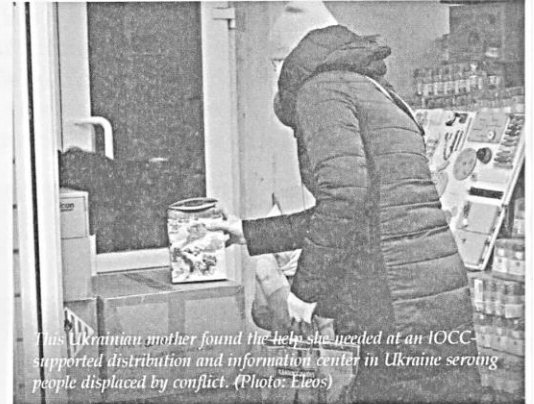
This Ukrainian mother found the help she needed at an IOCC-supported distribution and information center in Ukraine serving people displaced by conflict.

In Romania, working with a long-time Church partner, IOCC is serving refugees and host communities.