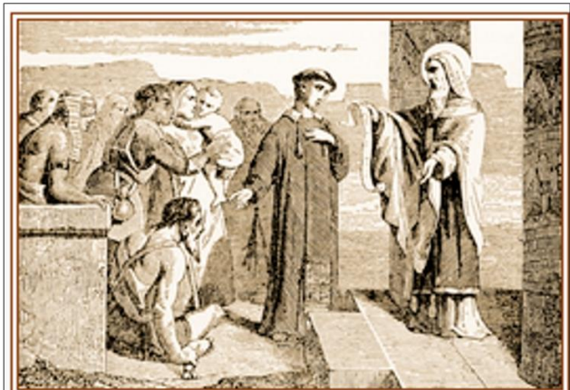
Saint John the Almsgiver

*** Sign-up Sheets available in the Church Hall.